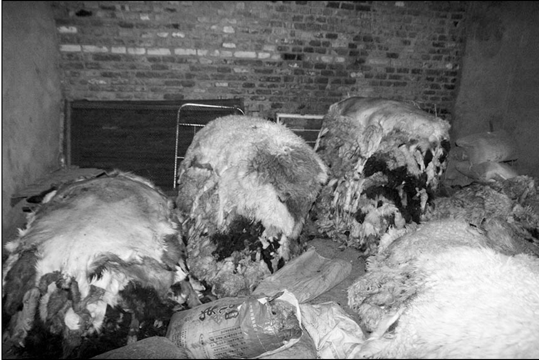
Figure II-2. Ganaa's Skin Storage Area, Harkorin Soum , Övörkhanga i Aimag 32