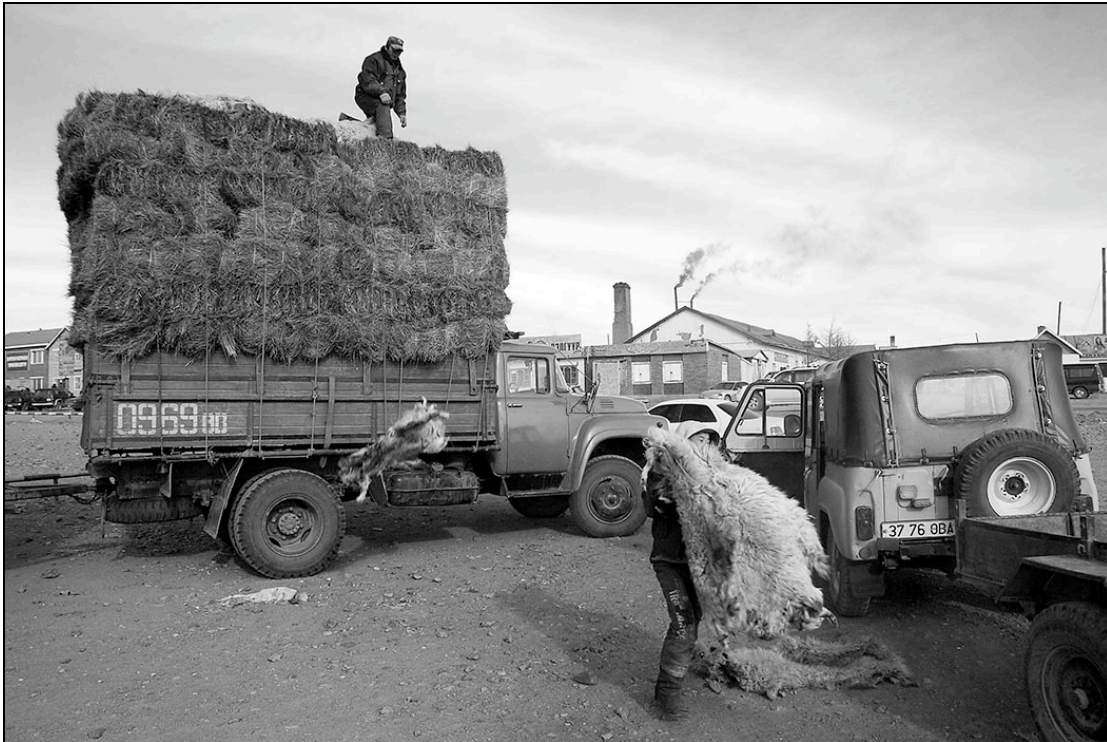
Figure II-3. Gantömör & son unload countryside skins to Sanjaa’s waiting trailer